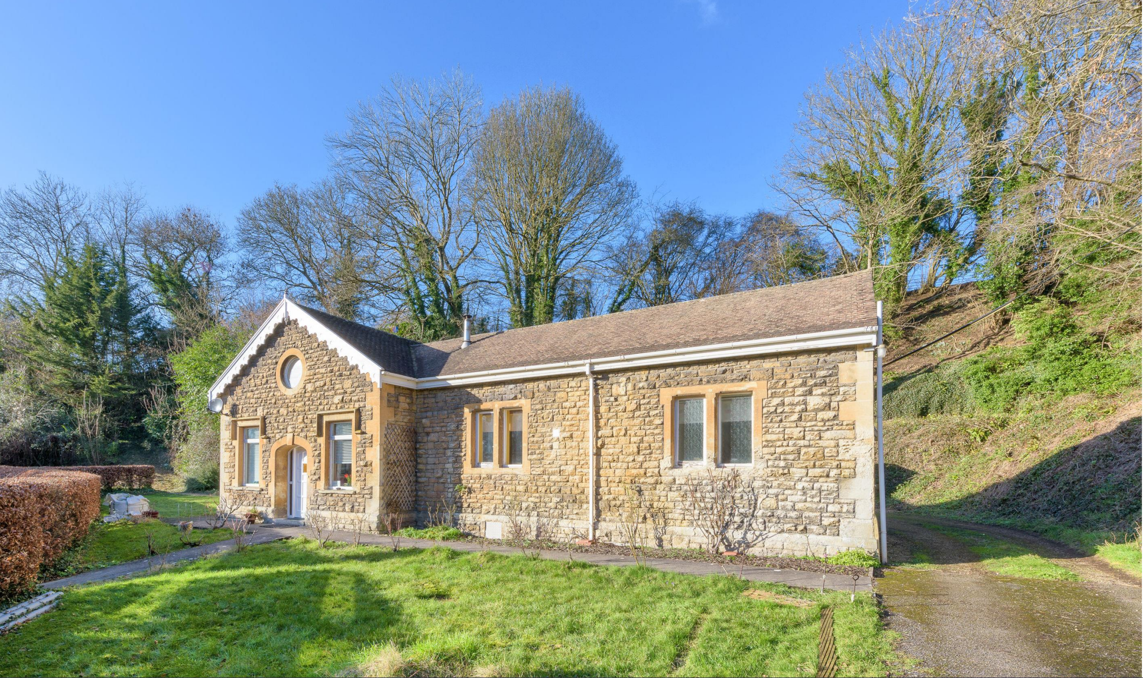
The Old Pumthouse 268a Avoncliff, Bradford on Avon, Wiltshire, BA15 2HA